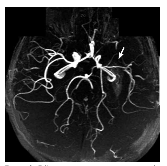
Figure 3. Follow-up magnetic resonance angiography shows significant improvement of cerebral lesions (arrow).