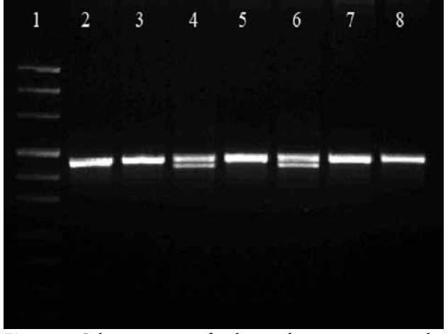
Figure 3. Gel appearance of polymorphism in intron 4: the 1<sup>st</sup> lane is the marker; the 4<sup>th</sup> and 6<sup>th</sup> lanes are ba; the other lanes are bb.

more prevalent in the control group (p<0.001). The T allele frequency was also higher with a p<0.001. The distribution of the a/b polymorphism and allele frequencies did not differ significantly between the two groups (p=0.159 and p=0.453, respectively).